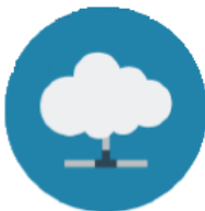
Channel Ability Enable