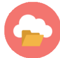
Cloud Service Embedded