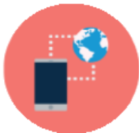
Telecom Service Open