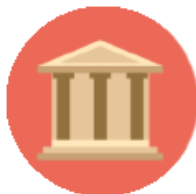
E-Government Service Enable