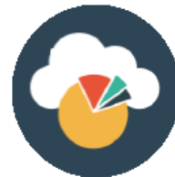
Big Data & AI Ability Enable