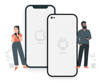
Self Service App